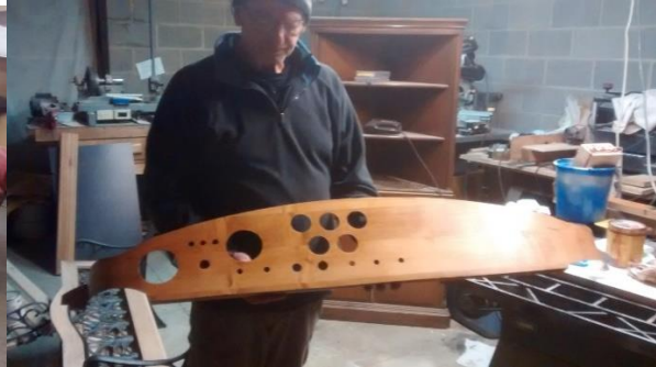
Body off the frame and the wood veneer for the dash.