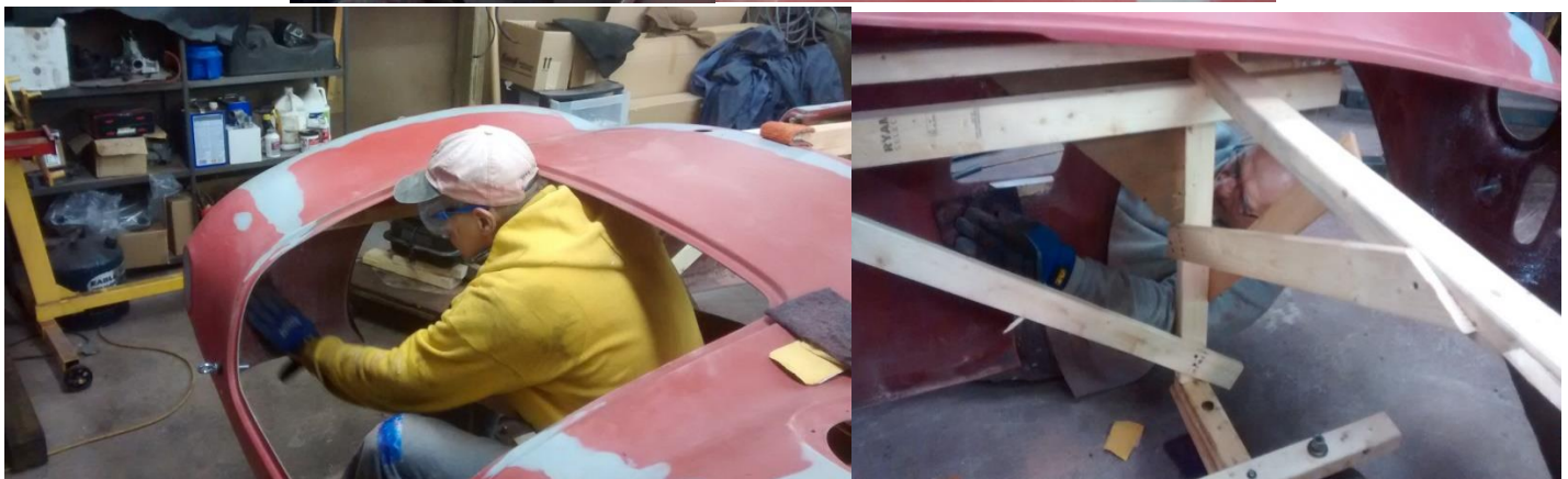
The tedious task of sanding both the topside and underneath.