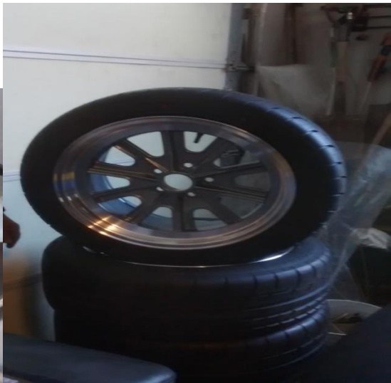
More of the gas tank installation – that does not look fun! Tires for the car.