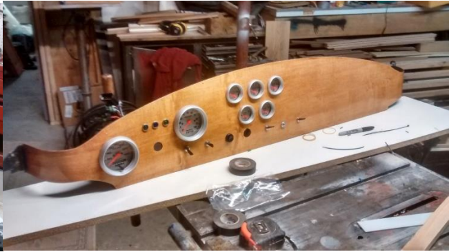
Installation of gauges into the dash