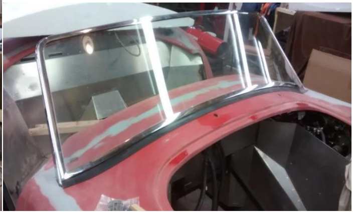
The body ready to go to the painters and the installation of the windshield.