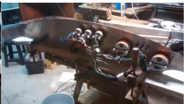
The back of the instrument panel and wiper motor installation.