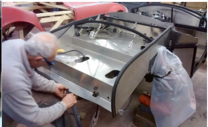
Gas tank installation